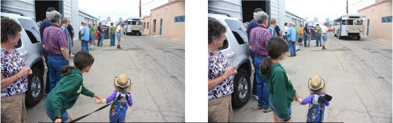
Guests watch as it comes down Hughes Street by our restoration shop.