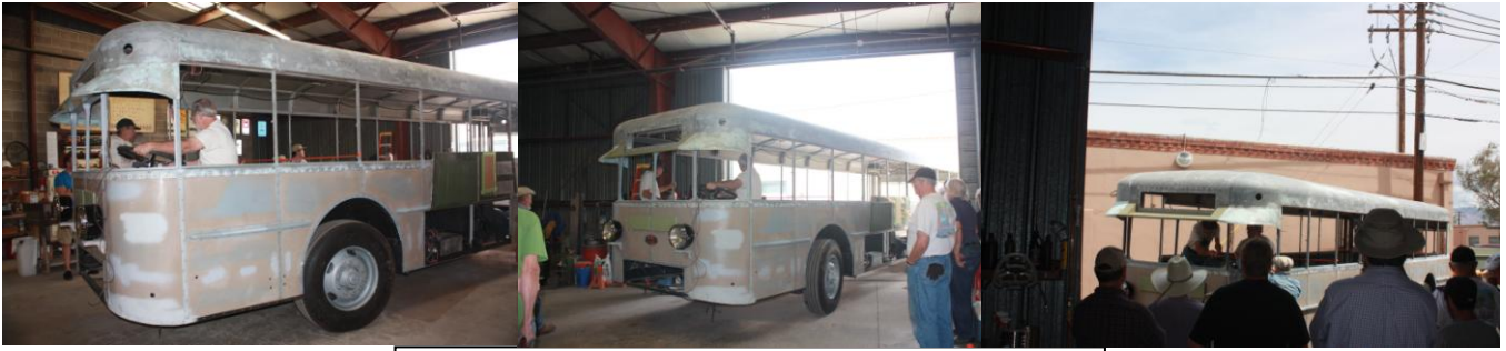
Backing it out of the shop for the test run.